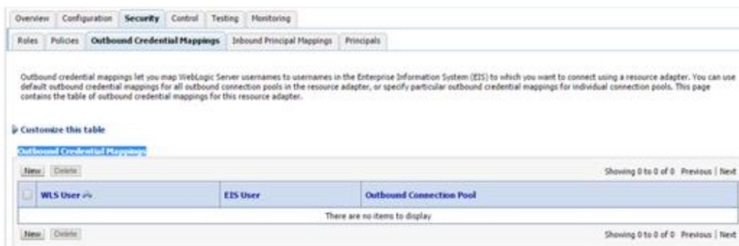
Fig.2 Shows setting for com.ofss.digx.connector.rar

Click Security->Outbound Credential Mapping. This will display Outbound Credential Mappings table.